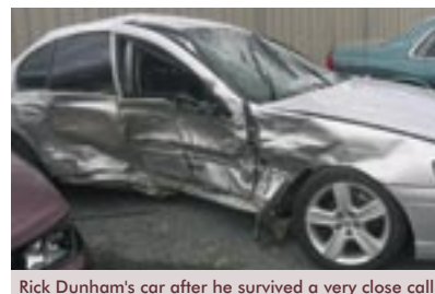
Rick Dunham's car after he survived a very close call

After two recent accident involving company employees, the following reminder from the TAC is as relevant as ever. Driving on rural roads over long distances can put added stresses on both car and driver. Long trips should be well planned to ensure safe arrival. Fatigue must be recognised as a potential hazard - it is estimated to be a major factor in around 30% of serious crashes. You might be tempted to push yourself to the limits to reach the destination. This increases your risk of a serious crash.